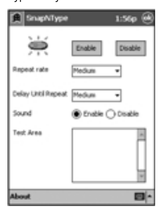
Fig. 6. SnapNType configuration screen

To access the SnapNType application (see Fig. 6), tap "Start", and then "SnapNType" on your iPAQ.